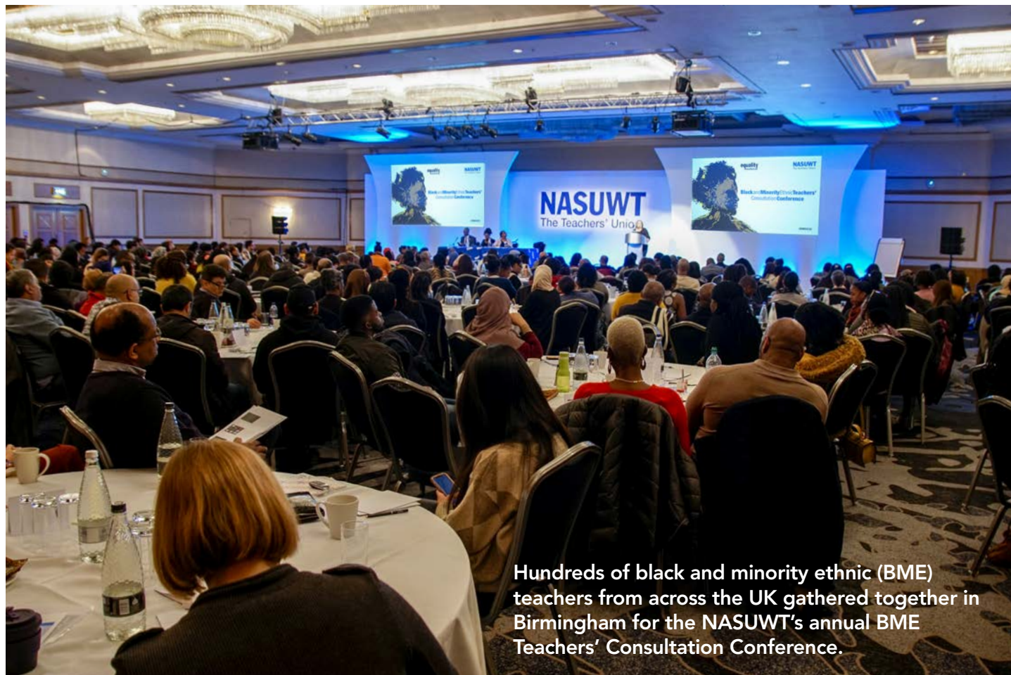
Hundreds of black and minority ethnic (BME) teachers from across the UK gathered together in Birmingham for the NASUWT's annual BME Teachers' Consultation Conference.

Many BME teachers experience a range of unwanted and unwarranted behaviours from colleagues, students and parents that are demeaning to their racial heritage or identity. Behaviours such as racist comments and jokes, bullying and harassment, physical violence, being singled out and treated differently are an everyday occurrence. Microinsults, microinvalidations and other forms of covert racism appear to be a feature of daily life for many BME teachers.